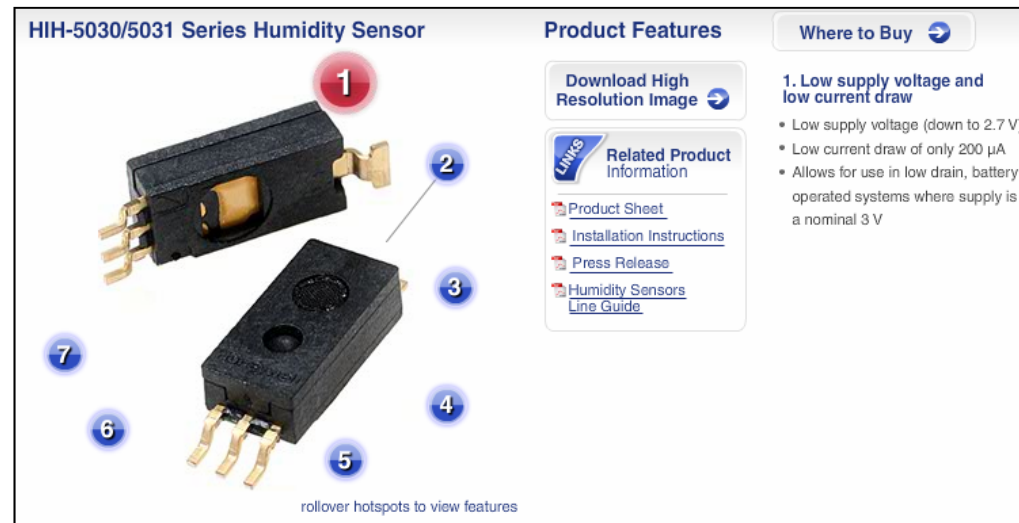
Webpage with Rollovers